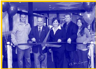
Bin 100 Restaurant celebrated their Grand Opening with a Ribbon Cutting Ceremony.