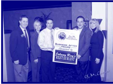
Johnny Ray's Restaurant hosted a Business After Hours in February