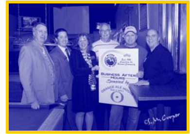
Thanks to Orange Ale House for sponsor- ing Business After Hours in January.