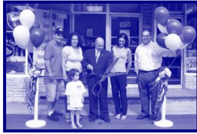
Waters Edge Deli celebrated their 1st Anniversary with a ribbon cutting.