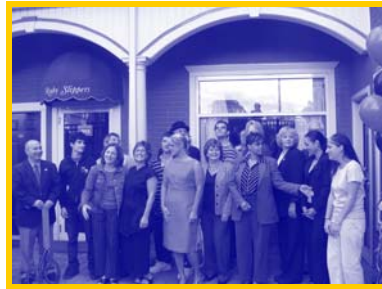
A ribbon cutting ceremony was held at Ruby Slippers in celebration of their 5 th Anniversary.