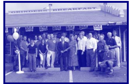
Bella's Deli celebrates their grand opening with a ribbon cutting ceremony in September.