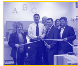
ABC Printing celebrated their expansion with a ribbon cutting.