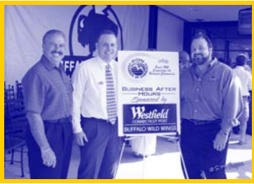
In July members enjoyed networking on the patio at Business After Hours, Buffalo Wild Wings, Westfield Connecticut Post