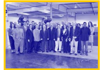
Marble and Granite celebrated their new location with a ribbon cutting.