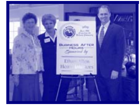
Business After Hours at Ethan Allen.