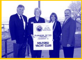
Business After Hours at Milford Yacht Club