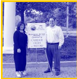
Carriage Green hosted Business After Hours in May