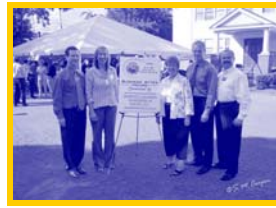
Hurwitz, Sagarin, Slossberg & Knuff hosted June's Business After Hours.