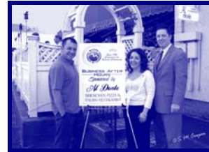
Al Dente hosted Business After Hours in May.

A Special Thanks to our Hosts & Sponsors!