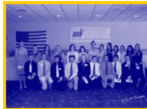
25 scholarships were awarded at the State of the City address.