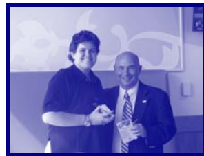
Starbucks celebrated the opening of their new store in Milford.