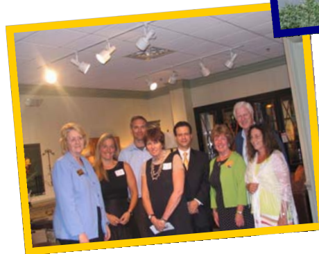
Milford and Orange Chambers of Commerce enjoy Business After Hours at Drexel Heritage.