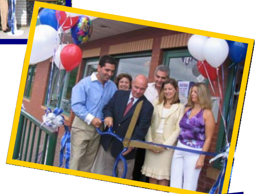
Shoreline Family Chiropractic & Wellness ribbon cutting in July.