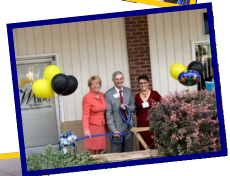
Women's Business Development Center opening their doors in July.