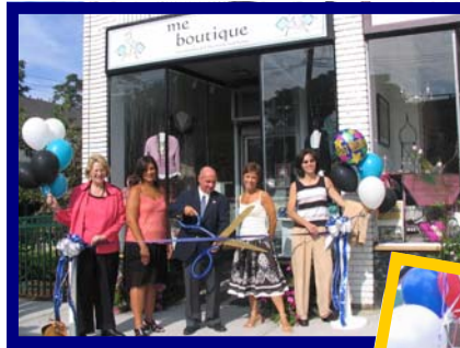
Cutting the ribbon at me boutique in August.